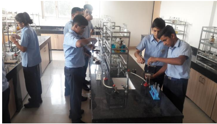
BIOLOGY LAB PHOTO